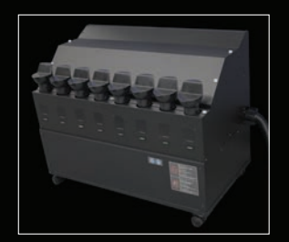
Optional Bulk Ink System with 3L capacity per colour